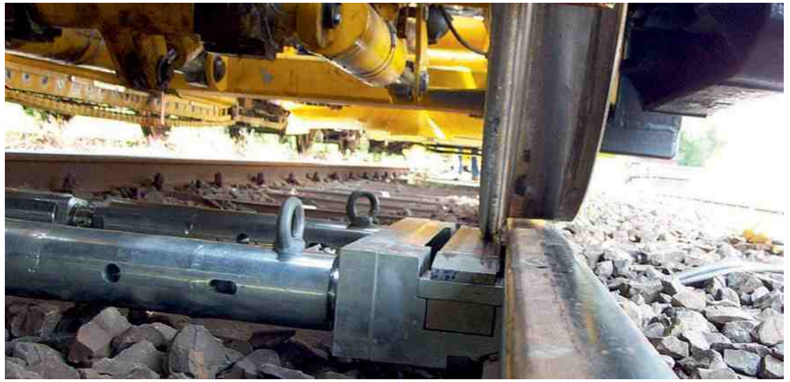
RALF lifts the wheel off the rail. The wheel stands on its flange, the tread is suspended some millimeters above the rail head.